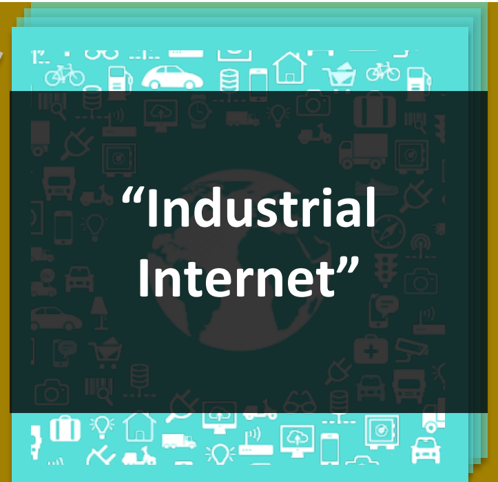
Internet of Things